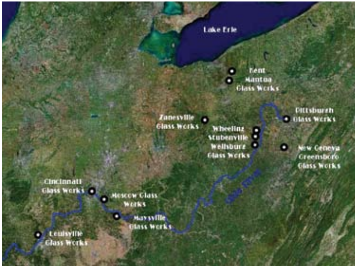
Midwest glass manufacturing locations.

It was made in the first glasshouses of the Ohio River area. The glass was produced in the late 1700s and early 1800s by craftsmen trained in the Stiegel tradition of glass manufacturing. Henry Stiegel was an ambitious man who brought the finest glass blowers and craftsmen from Europe in the 1860s to produce glass in America. Stiegel produced glass in a quality matched only by the finest glass houses in Europe.