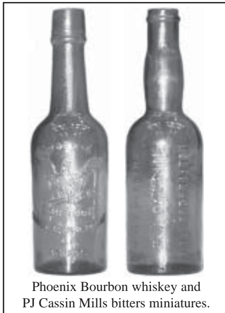
Phoenix Bourbon whiskey and PJ Cassin Mills bitters miniatures.