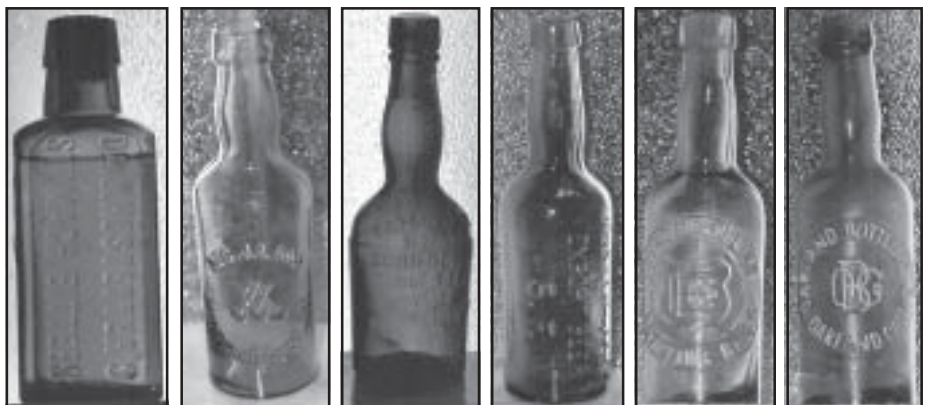
[ 1 ] [ 2 ] [ 3 ] [ 4 ] [ 5 ] [ 6 ]