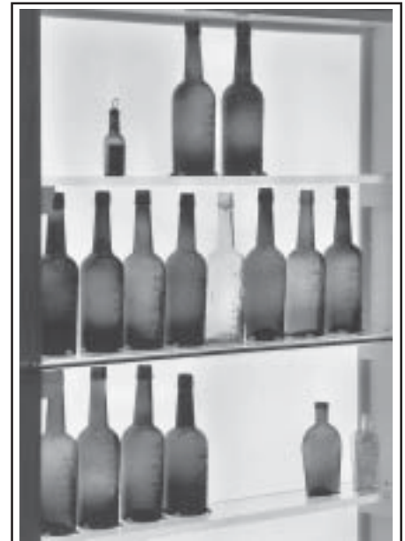
Marty Hall’s Kentucky whisky display