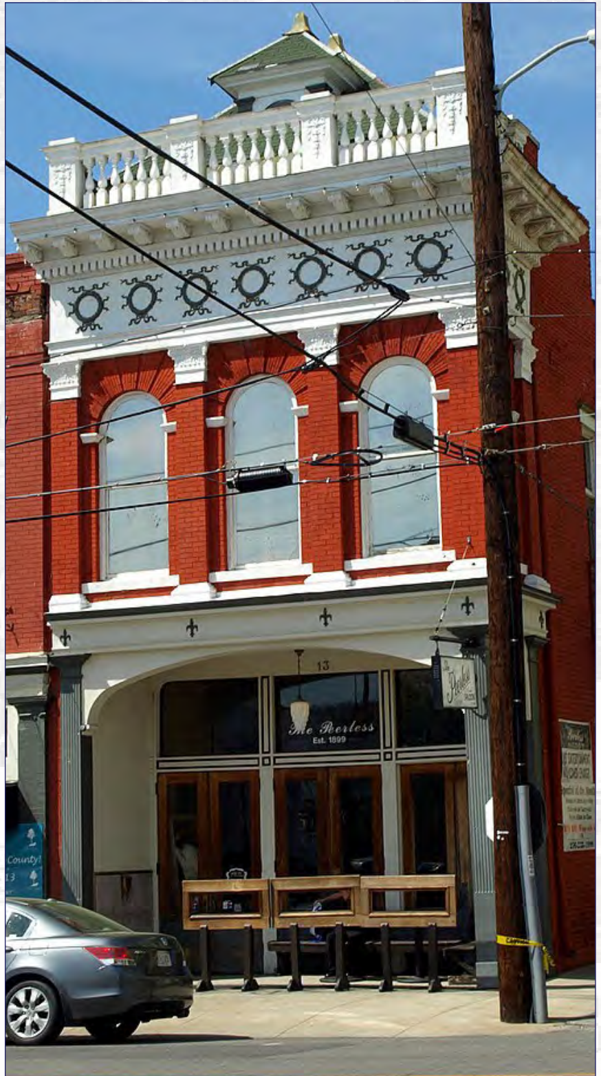
Fig 1: The Peerless Saloon as it's known, and how the building looks today