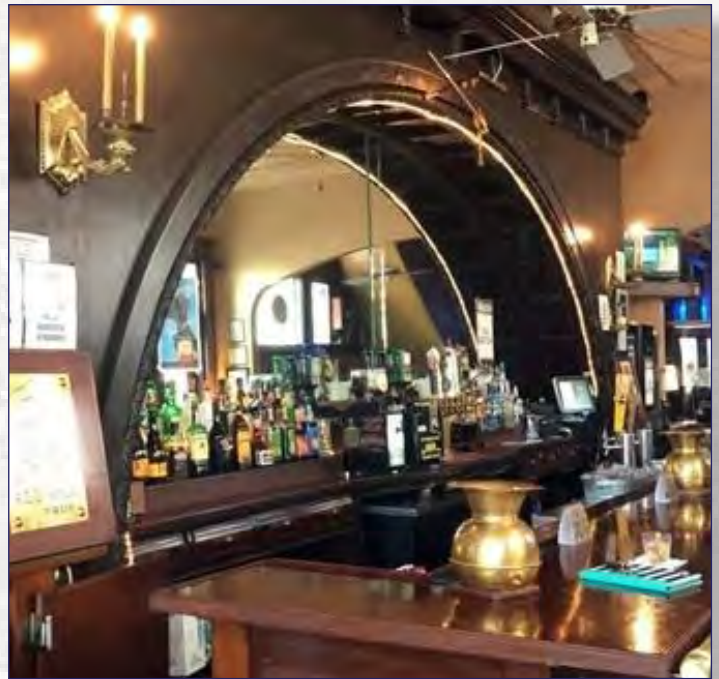
Fig 4: The Peerless featured a massive mirror-backed mahogany bar