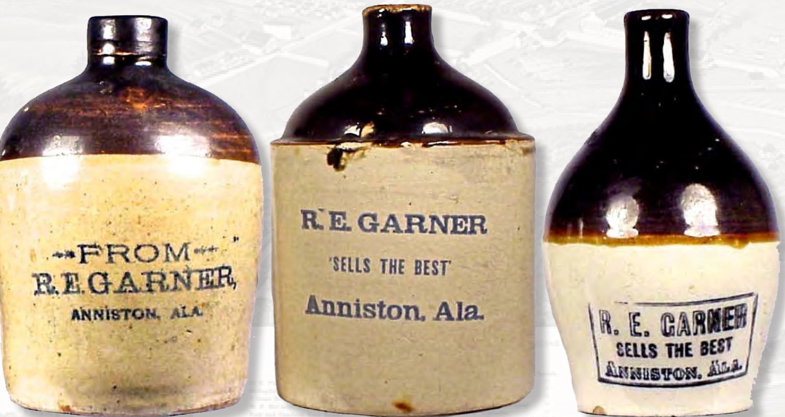
Fig 6-8: Garner also decanted the whiskey into a range of ceramic jugs for sale, all bearing his name and some with the motto, "Sells the Best."