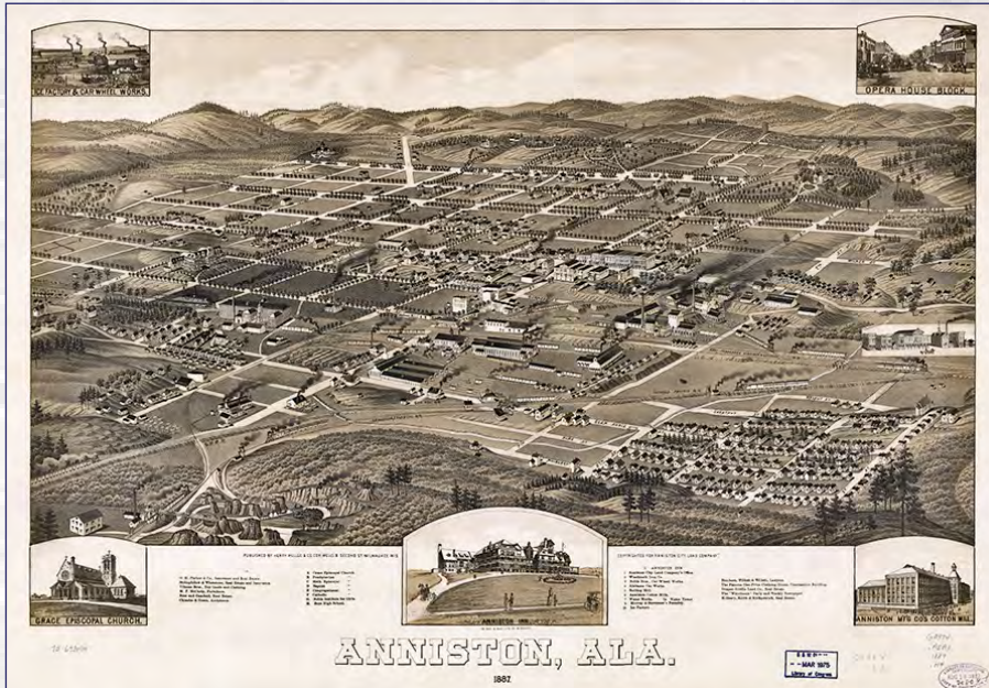
Fig 2: The Peerless Saloon as it's known, and how the building looks today