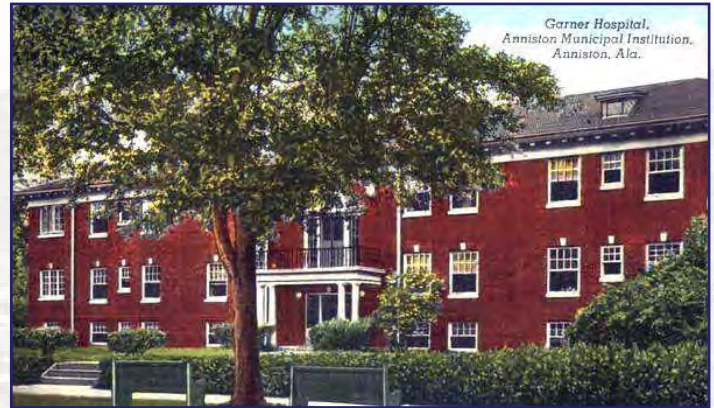
Fig. 15: Using his money, the city fathers built a new municipal medical center and named it Garner Hospital

During National Prohibition, the Peerless Saloon for a time became a jewelry store, sat empty for years and at one point faced demolition until 1985 when it was placed on the Register of Historic Places by the National Park Service. The building