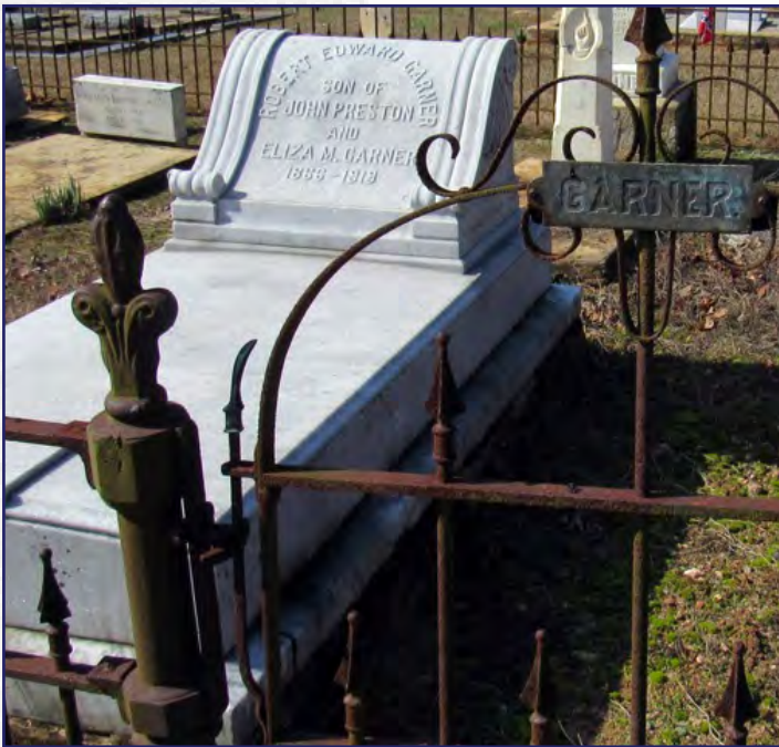
Fig. 14: His unusual gravestone is in the shape of a couch and the inscription mentions him only as a son

bama voted for a complete ban on alcohol. Enforcement was spotty in Anniston and it was whispered in town that “Daddy” continued to bootleg liquor through his now-shut saloon. The activities upstairs apparently continued unabated despite the liquor ban.