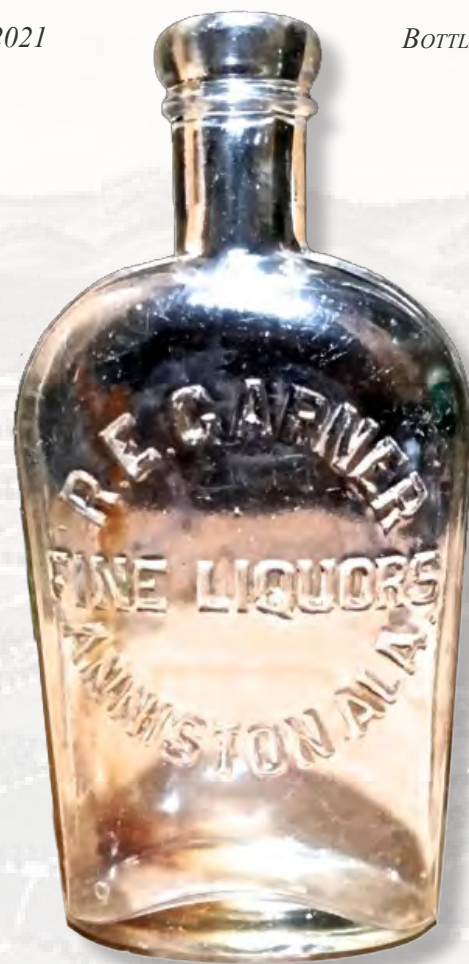
Fig 10: Garner also featured his own proprietary brand, "Old Wildcat," at The Peerless bar and sold much of it in glass bottles