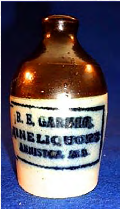
Fig. 12: Several giveaways included a mini-jug containing a swallow or of two of whiskey