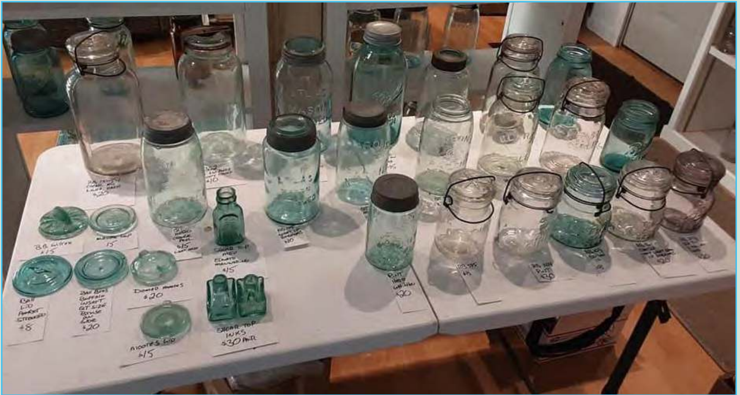
The Virtual Jar Show sale table by Roland Bard

and experimenting by holding additional online specialty specific events and quarterly shows. The first ever Virtual Jar Show was announced in December 2020 and held from January 13-17, 2021. There was an outpouring of support by antique jar collectors, with over 30 tables participating in the event. Most vendors had significant success through this online format, many mentioning that they sold just as much as they have in past face-to-face bottle and jar shows. The Virtual Jar Show also hosted a Zoom show and tell meeting on January 15. The virtual meeting experiment was successful enough that the Advanced Ball & Fruit Jar Collectors group will now be holding monthly virtual club meetings every second Saturday of the month at 8:00 PM EST.