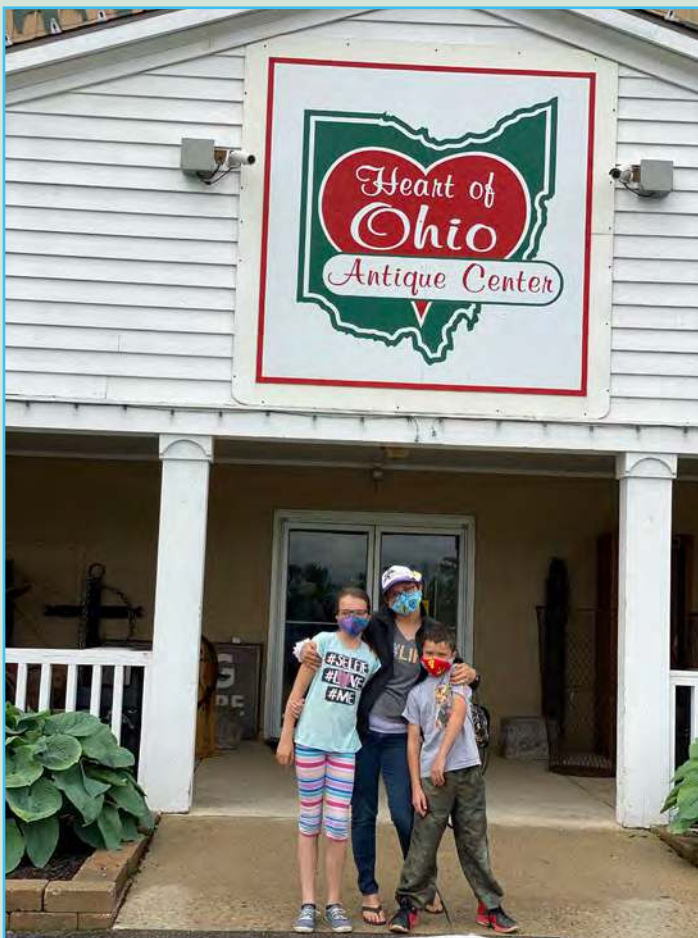
My family antiquing with face masks

Members of the group were allowed to put sale or display tables together for free at home. During the week, prior to the weekend show, members would take photos and/or videos of their table(s), add a description with seller guidelines and post the table(s) to the group for pending approval by the administrators or moderators. The post-pending feature of the group was utilized to hold all tables until 11:00 AM on Saturday morning, so they could all be released simultaneously, just like you are entering a conventional show. From Saturday to Monday, the tables remained posted and by Tuesday morning, all tables were deleted to essen-