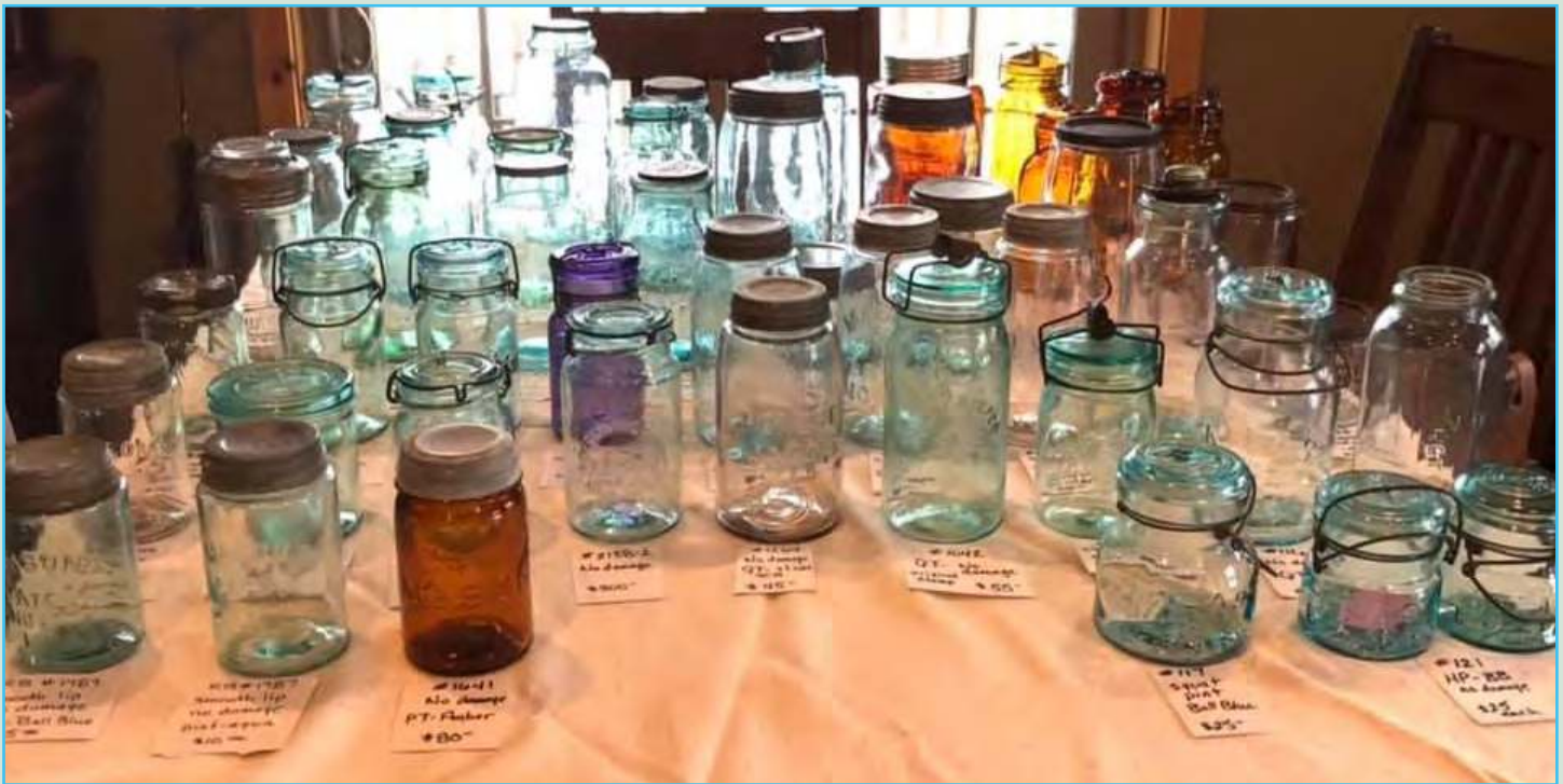
The Virtual Jar Show sale table by Tamara Williammee.