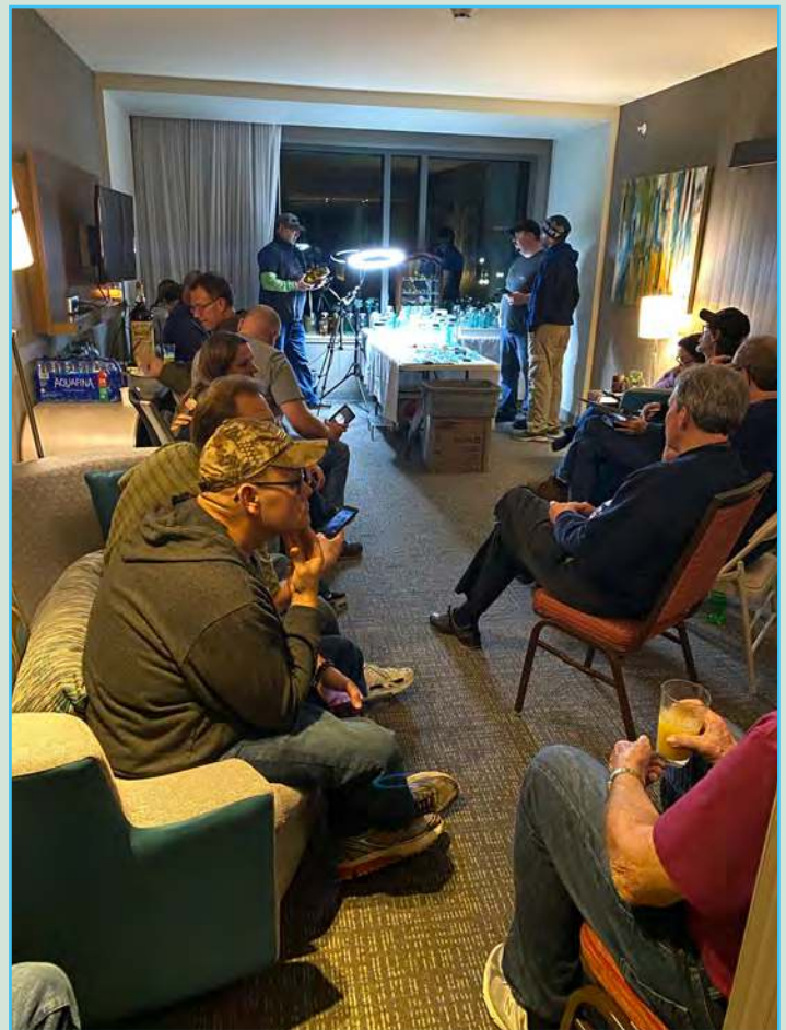
We'reLive Antiques & Collectables Auctions virtual/in person auction from the Muncie Fruit Jar Show 2020

Members of the group were allowed to put sale or display tables together for free at home. During the week, prior to the weekend show, members would take photos and/or videos of their table(s), add a description with seller guidelines and post the table(s) to the group for pending approval by the administrators or moderators. The post-pending feature of the group was utilized to hold all tables until 11:00 AM on Saturday morning, so they could all be released simultaneously, just like you are entering a conventional show. From Saturday to Monday, the tables remained posted and by Tuesday morning, all tables were deleted to essen-