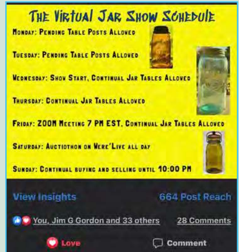
The Virtual Jar Show schedule