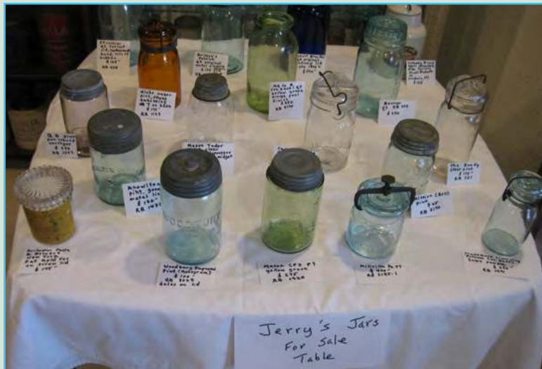
The Virtual Jar Show sale table by Jerry Ikeda

bottle, jar and insulator shows everywhere, this is an attractive resource that will allow show organizers to reclaim their shows by moving them online and adapting with the current circumstances surrounding COVID-19.