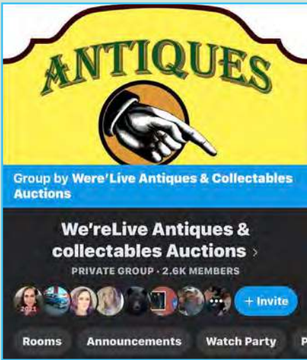
Screenshot of We'relive Antiques & Collectables Auctions group